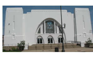
5. COMMUNITY BUILDING * 215 FIRST STREET 1939

PLACED ON NATIONAL REGISTER IN 1997, THE 1893 CLASSICAL SCHOOL WAS JOINED WITH THE 1916 CLASSICAL REVIVAL HIGH SCHOOL IN 1955. THE GABLED ROOF HAS PAVILIONS AT EACH END.