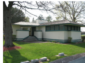
14. PETIT CHAPEL * 1908 BELVIDERE CEMETERY

ALL THREE GABLES OF THE QUEEN ANNE HOME FEATURE DECORATIVE VERGE BOARD AND BRACKETS; THERE IS A WRAP-AROUND PORCH AND A BACK PORCH. CROWN AND DENTIL MOLDINGS ARE OVER THE WINDOWS.