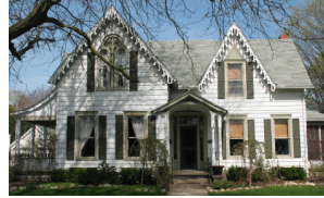
8. WITBECK RESIDENCE 1864 217 W HURLBUT AVENUE

THE CROSS-GABLED GOTHIC REVIVAL HOME WAS DESIGNED TO FACE EAST; GOTHIC-ARCHED BAY WINDOWS ARE ON BOTH EAST AND SOUTH FAÇADES. AN ORIGINAL PORCH HAS BEEN REMOVED. (LD, 1996)