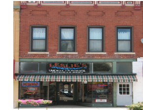
29. HARNISH AND MCCARTNY 518 S STATE STREET C. 1896

THE STEEPLY-GABLED FEDERAL-STYLE HOME BUILT OF NATIVE YELLOW LIMESTONE WITH LARGE SIX-OVER-SIX WINDOWS IS ONE OF THE OLDEST STONE HOUSES IN THE ORIGINAL TOWN OF BELVIDERE. LD-1994.