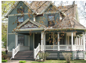
19. BENJAMIN HERBERT HOME 405 E LINCOLN AVENUE 1895

THE THREE-STORE BRICK BUILDING, BUILT BY JOSIAH BALLIET AFTER AN EARLIER STORE BURNED, WAS ELEGANT AND "SPLENDIDLY FITTED UP." JOE RETIRED IN 1941 AT 92.