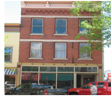
25. MARSKE FURNITURE 1852 410 S STATE STREET

THE COMMERCIAL STYLE BUILDING, BUILT ONE YEAR AFTER THE RAILROAD CAME TO TOWN OF BRICK AND LOCAL LIMESTONE, HAS SECOND-STORY WINDOWS WITH LIMESTONE LINTELS AND SILLS. LD 2006