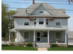
2. DeWOLF RESIDENCE 913 UNION STREET 1901

A LOCAL LANDMARK SINCE 2006, THE VICTORIAN HOME FEATURES A FRONT AND SIDE GABLE WITH FISH-SCALE SIDING AND A LARGE WRAP-AROUND PORCH.