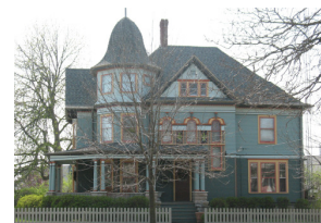
30. ALEXANDER RESIDENCE 519 S MAIN STREET 1902

THE COMMERCIAL-STYLE BUILDING WAS LOCALLY LISTED IN 2006; A RECESSED SINGLE-DOOR ENTRY IS FLANKED BY LARGE DISPLAY WINDOWS AND TOPPED WITH TRANSOM WINDOWS.