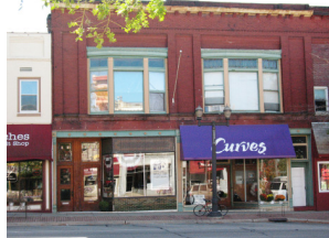
6. THE BALLIET BUILDING AND WRIGHT BUILDING 403-05 S STATE STREET 1901

PART OF THE 1997 HIGH SCHOOL NATIONAL REGISTER LISTING, THE AUDITORIUM WAS A WPA PROJECT CONSTRUCTED IN THE ART DECO STYLE. LOCAL LANDMARK DESIGNATION--1993.