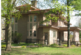
20. FOOTE RESIDENCE 1913 303 E LINCOLN AVENUE

THE QUEEN ANNE, WITH HIPPED ROOF AND LOWER CROSS GABLES HAS PALLADIAN WINDOWS IN THE FRONT GABLE. THE WRAP-AROUND PORCH HAS PEDIMENTS OVER THE FRONT AND SIDE ENTRIES.