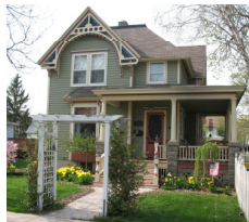
13. THOMAS RAMSAY HOUSE 203 JACKSON STREET 1893

THE STATE STREET FAÇADE WAS REMODELED IN 1906 WITH TWO STORE FRONTS AND A SECOND STORY OF FIRED BROWN BRICK TOPPED WITH AN ORNATE METAL CORNICE.