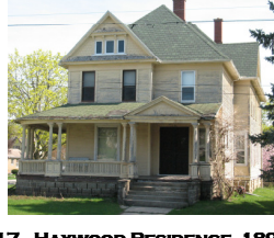
17. HAYWOOD RESIDENCE 1890 321 E MADISON STREET

DESIGNATED IN 1993, THE HOME WAS CONSTRUCTED WITH A VERANDA ON THE WEST AND A BAY WINDOW ON THE NORTH. THE FORMER 1850S HOME SERVES AS THE KITCHEN TO THE EAST.