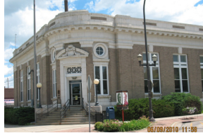
21. BELVIDERE POST OFFICE * 200 S STATE STREET 1911

THE BRICK AND GRANITE PRAIRIE-STYLE HOME FEATURES A PORTE-COCHERE SUPPORTED BY CLASSICAL COLUMNS AND A LARGE DORMER WITH OVERHANGING EAVES AND RIBBON WINDOWS ON THE WEST FAÇADE. LD, 1991.