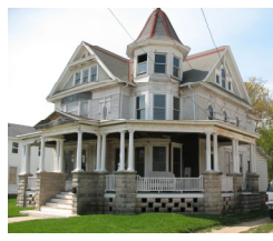
3. D. A. FULLER RESIDENCE 809 S STATE STREET C. 1890

DESIGNATED IN 2006, THE FOUR-SQUARE WAS HOME TO JUDGE WILLIAM DeWOLF. THE GABLED FRONT FEATURES A PORCH THAT WRAPS AROUND TO THE SOUTH SIDE OF THE HOUSE.