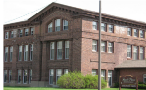
4. BELVIDERE HIGH SCHOOL * PEARL AND FIRST STREETS

LOCAL 1988, NATIONAL REGISTER 2005. ORIGINAL GREEK REVIVAL HOUSE. MID-SECTION IS CARPENTER GOTHIC WITH LACEY BARGEBOARD BUILT DURING THE CIVIL WAR. BAYS ADDED 1890.