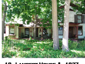
18. LAMPERT HOUSE * 1837 410 E LINCOLN AVENUE

DESIGNATED IN 1991, THE QUEEN ANNE HOME FEATURES A WRAP-AROUND PORCH SUPPORTED BY 13 TAPERED COLUMNS, GABLES WITH FISH-SCALE SIDING, BUILT-INS AND MAPLE POCKET DOORS.