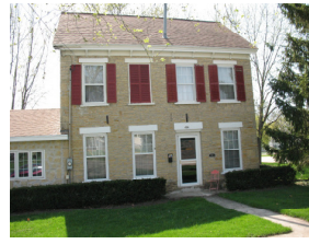
15. MONROE RESIDENCE 424 N MAIN STREET 1842

TO HONOR DR. WILLIAM PETIT, ARCHITECT FRANK LLOYD WRIGHT DESIGNED THE PRAIRIE STYLE BUILDING AS A SHELTER FOR MOURNERS. THE SYMMETRICAL BUILDING EMBODIES WRIGHT'S PRAIRIE IDEALS WITH HIP ROOF AND OVER HANGING EAVES.