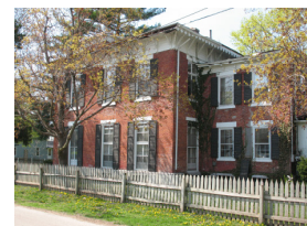
31. GILMAN RESIDENCE 1853 628 BUCHANAN STREET

THE MAIN STREET FAÇADE DISPLAYS A LARGE ATTIC GABLE, A CORNER CUPOLA WITH A 3-WINDOW BAY BELOW AND THREE PALLADIUM WINDOWS WITH ONE EXTENDING TO THE FIRST FLOOR. (LD, 1993)