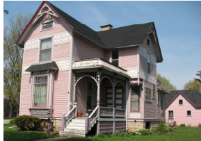
10. ANDRUS RESIDENCE C. 1895 619 N STATE STREET

THE TWO-STORY BUILDING WAS UPGRADED WITH A THIRD STORY IN THE 1890S. CONSTRUCTED OF BRICK WITH LIMESTONE BANDS, THE STREET LEVEL ORIGINALLY FEATURED A CENTRAL ENTRY.