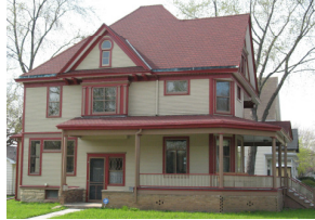
11. MORAN RESIDENCE 704 N STATE STREET 1898

1991 LOCALLY DESIGNATED, THE BAY-WINDOWS OF THE QUEEN-ANNE COTTAGE FEATURE BRACKETS AND ART GLASS. SHINGLES AND WOOD ORNAMENTS ACCENT THE GABLES.