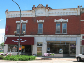
23. LOOF BUILDING C. 1852 402-04 S STATE STREET

LOCALLY DESIGNATED IN MAY 2004, THE VICTORIAN HOME FEATURES A FRONT GABLE FLANKED BY A COVERED PORCH TO THE WEST AND A SCREENED PORCH TO THE EAST.