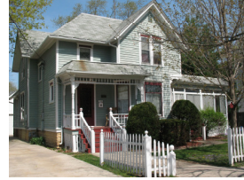
9. YOUNDT HOUSE 1894 117 W HURLBUT AVENUE

THE GOTHIC REVIVAL HOME HAS PILASTER WITH FLORAL ORNAMENTATION BETWEEN ROUND-HEADED WINDOWS BENEATH ORNATE VERGE BOARD IN THE FRONT GABLE. FOUR GENERATIONS OF WITBECKS CALLED THIS HOME FOR OVER 125 YEARS.