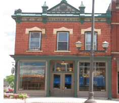
27. BRANNER BLOCK C. 1852 506 S STATE STREET

THE FOOTE BUILDING'S BUCHANAN STREET FAÇADE IS MUCH AS IT WAS WHEN ORIGINALLY CONSTRUCTED IN 1850 WITH IRON COLUMNS AND LARGE WINDOWS. LOCAL LANDMARK, 2006.