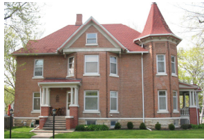
12. WILLIAM HERBERT HOME 804 N STATE STREET 1897

THE ASYMMETRICAL QUEEN ANNE TWO-STORY FEATURES A KEYHOLE WINDOW IN THE SOUTH GABLE, RIBBON WINDOWS IN THE FRONT GABLE, AND DENTIL AND BRACKET ORNAMENTATION. LD 1991.