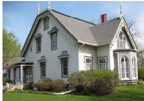
7. MOLONY RESIDENCE C. 1865 425 W LINCOLN AVENUE

THE BEAUX ARTS CLASSICAL U. S. POST OFFICE WAS DESIGNED BY JAMES KNOX TAYLOR, FEATURING ROUNDED ENTRANCE AND KEY-STONED WINDOWS. LOCAL 1997, NATIONAL REGISTER 2000.