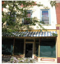
23. P. CURTIS BLOCK C. 1852 408 S STATE STREET

BUILT AS TWO GROUND-LEVEL RETAIL STORES, THE FAÇADE WAS REMODELED IN 1893 WHEN THE SECOND-STORY LOOF HALL WAS ADDED. CARVED WINDOW HOODS AND AN ORNATE METAL CORNICE WERE ADDED. LOCAL, 2006.