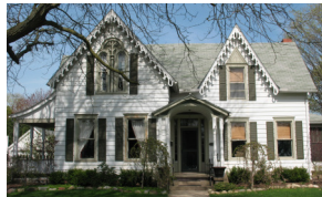
8. WITBECK RESIDENCE 1864 217 W HURLBUT AVENUE

THE CROSS-GABLED GOTHIC REVIVAL HOME WAS DESIGNED TO FACE EAST; GOTHIC-ARCHED BAY WINDOWS ARE ON BOTH EAST AND SOUTH FAÇADES. AN ORIGINAL PORCH HAS BEEN REMOVED. (LD, 1996)