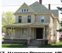
17. HAYWOOD RESIDENCE 1890 321 E MADISON STREET

DESIGNATED IN 1993, THE HOME WAS CONSTRUCTED WITH A VERANDA ON THE WEST AND A BAY WINDOW ON THE NORTH. THE FORMER 1850S HOME SERVES AS THE KITCHEN TO THE EAST.