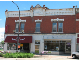
22. LOOF BUILDING C.1852 402-04 S STATE STREET

LOCALLY DESIGNATED IN MAY 2004, THE VICTORIAN HOME FEATURES A FRONT GABLE FLANKED BY A COVERED PORCH TO THE WEST AND A SCREENED PORCH TO THE EAST.