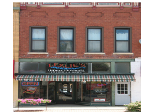
28. HARNISH AND MCCARTNY 518 S STATE STREET C.1896

THE COMMERCIAL-STYLE BUILDING WAS LOCALLY LISTED IN 2006; A RECESSED SINGLE-DOOR ENTRY IS FLANKED BY LARGE DISPLAY WINDOWS AND TOPPED WITH TRANSOM WINDOWS.