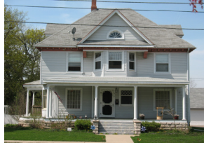
2. DeWOLF RESIDENCE 913 UNION STREET 1901

THE A LOCAL LANDMARK SINCE 2006, THE VICTORIAN HOME FEATURES A FRONT AND SIDE GABLE WITH FISH-SCALE SIDING AND A LARGE WRAP-AROUND PORCH.