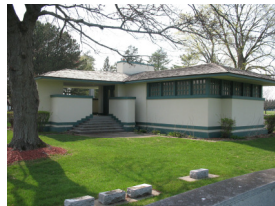
14. PETIT CHAPEL * 1908 BELVIDERE CEMETERY COMMISSIONED BY EMMA GLASNER PETIT TO HONOR DR. WILLIAM PETIT, ARCHITECT FRANK LLOYD WRIGHT DESIGNED THE PRAIRIE STYLE BUILDING AS A SHELTER FOR MOURNERS WITH OVER HANGING EAVES.

ALL THREE GABLES OF THE QUEEN ANNE HOME FEATURE DECORATIVE VERGE BOARD AND BRACKETS; THERE'S A WRAP-AROUND PORCH AND A BACK PORCH. CROWN AND DENTIL MOLDINGS ARE OVER THE WINDOWS.