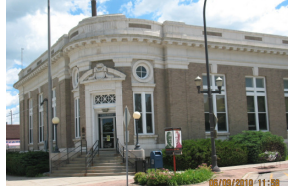
21. BELVIDERE POST OFFICE * 200 S STATE STREET 1911

THE BRICK AND GRANITE PRAIRIE-STYLE HOME FEATURES A PORTE-COCHERE SUPPORTED BY CLASSICAL COLUMNS AND A LARGE DORMER WITH OVERHANGING EAVES AND RIBBON WINDOWS ON THE WEST FAÇADE. LD, 1991.