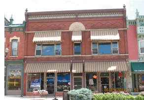
27. THE FOOTE BUILDING 508-10 S STATE STREET 1906;

LOCALLY LISTED IN 2006, THE TWO-STORY COMMERCIAL BUILDING FEATURES LIMESTONE LINTELS, CAST-IRON COLUMNS, A PAINTED-METAL CORNICE AND LARGE DISPLAY WINDOWS.