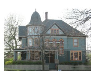
29. ALEXANDER RESIDENCE 519 S MAIN STREET 1902

THE COMMERCIAL-STYLE BUILDING WAS LOCALLY LISTED IN 2006; A RECESSED SINGLE-DOOR ENTRY IS FLANKED BY LARGE DISPLAY WINDOWS AND TOPPED WITH TRANSOM WINDOWS.