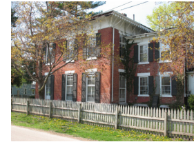
30. GILMAN RESIDENCE 1853 628 BUCHANAN STREET

THE MAIN STREET FAÇADE DISPLAYS A LARGE ATTIC GABLE, A CORNER CUPOLA WITH A 3-WINDOW BAY BELOW AND THREE PALLADIUM WINDOWS WITH ONE EXTENDING TO THE FIRST FLOOR. (LD, 1993)