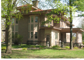
20. FOOTE RESIDENCE 1913 303 E LINCOLN AVENUE

THE QUEEN ANNE, WITH HIPPED ROOF AND LOWER CROSS GABLES HAS PALLADIAN WINDOWS IN THE FRONT GABLE. THE WRAP-AROUND PORCH HAS PEDIMENTS OVER THE FRONT AND SIDE ENTRIES.