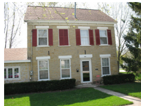
15. MONROE RESIDENCE 424 N MAIN STREET 1842 THE STEEPLY-GABLED FEDERAL-STYLE HOME BUILT OF NATIVE YELLOW LIMESTONE WITH LARGE SIX-OVER-SIX WINDOWS IS ONE OF THE OLDEST STONE HOUSES IN THE ORIGINAL TOWN OF BELVIDERE. LD-1994.