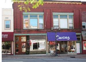
6. THE BALLIET BUILDING AND WRIGHT BUILDING 403-05 S STATE STREET 1901

PART OF THE 1997 HIGH SCHOOL NATIONAL REGISTER LISTING, THE AUDITORIUM WAS A WPA PROJECT CONSTRUCTED IN THE ART DECO STYLE. LOCAL LANDMARK DESIGNATION-1993.