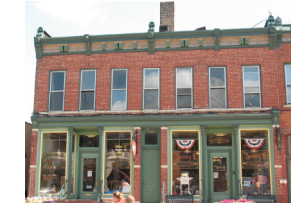
25. THE FOOTE BUILDING 105-07 BUCHANAN STREET

DESIGNATED IN 1992, THE 12-ROOM BRICK QUEEN-ANNE HOME FEATURES A TWO-STORY TOWER WITH A CONICAL ROOF.